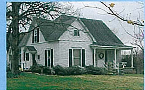
423 E. Spring