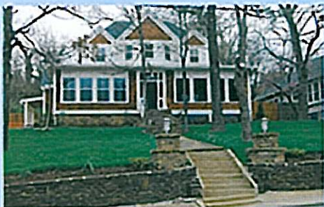
202 W. Lafayette