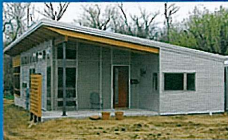
717 N. Washington