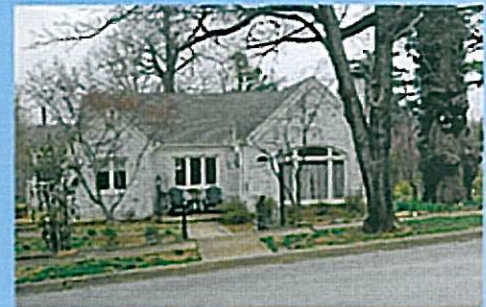
302 W. Ila