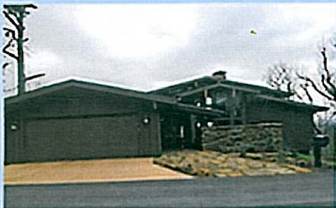
135 W. Skyline

Tickets = $20 Advanced / $25 day of Event